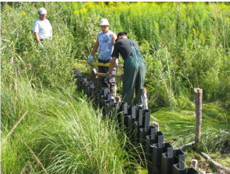
Figure 2 July 2011 - Plastic piling poles used for blocking drainage channels in ~107 ha of Amalva bog. (Arunas Pranaitis)