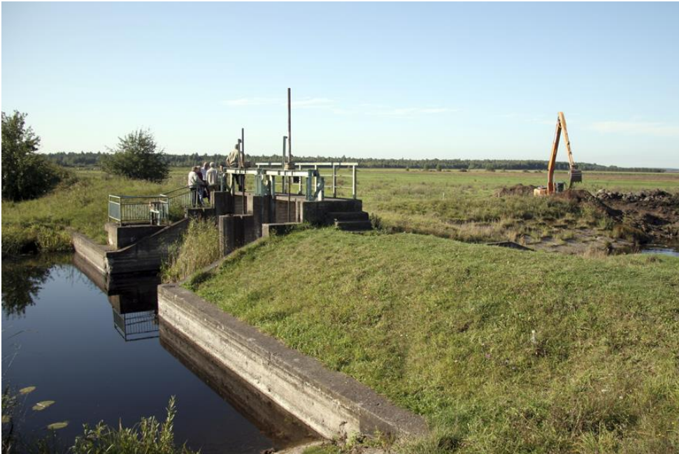
Figure 1 August 2009 - beginning of the reconstruction works of the Žuvintas sluice-regulator (Argaudas Stoskus)