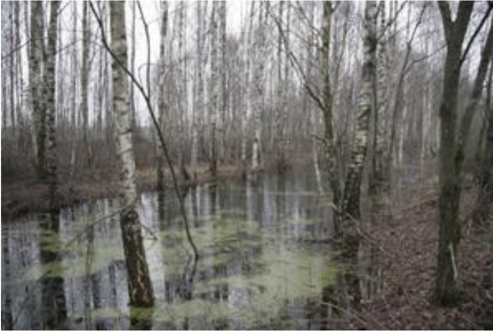
Figure 3 December 2011 - Blocking of the portion of the Amalvas polder channel neighbouring the very Amalva bog resulted in substantially elevated water levels and elimination of draining effect (Argaudas Stoskus)