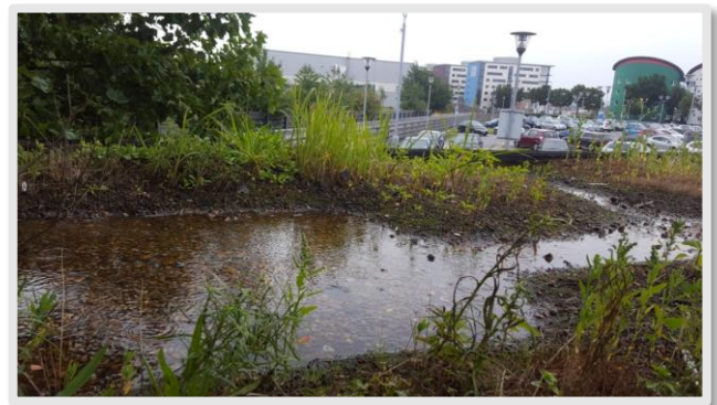
Ephemeral wetland green roof during summer rain event - University of East London Docklands Campus, London, UK.

However, if urban areas are to fulfil their potential in terms of providing habitats for biodiversity and opportunities for urban communities to experience nature on their doorsteps, design for biodiversity needs to be a key consideration in the development process. This project shows how academia-industry partnerships and learning-by-doing processes can help to support such targeted biodiversity-driven design.