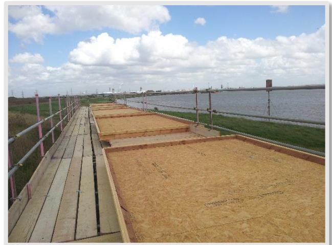
Wooden frames constructed as a base for the ephemeral wetland green roof experiment - Barking Riverside, London, UK.

successional habitat types that have been lost in the broader landscape to coastal management, agricultural intensification, urbanisation, etc (e.g. heathland, wildflower-rich open grassland, soft rock cliffs, littoral zones). A range of conservation target species in the pre-development brownfield area are found like water vole ( Arvicola amphibius ), grass snake ( Natrix natrix ), black redstart ( Phoenicurus ochruros ) and marsh warbler ( Acrocephalus palustris ) along with a broad invertebrate assemblage of regional importance (including the brown-banded carder bee ( Bombus humilis ) (UK Biodiversity Action Plan Priority Species) and Gymnosoma nitens (RDB1) and a number of nationally rare and scarce species).