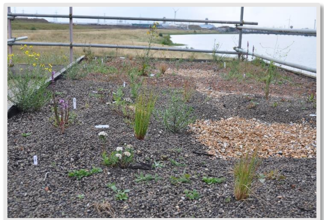
Toits verts à zone humide éphémère une fois les plantes installées, Barking Riverside, London, UK.

The test platforms were built according to small green roof construction best practice and following principles for biodiverse green roof design (e.g. using varied substrate types and depths and planting with native species). The roofs were seeded with a combination of three 100% wildflower seed mixes supplied by Emorsgate Seeds ( www.wildseed.co.uk ) as follows: EM8F wildflowers for wetlands; EN1F special pollen and nectar wildflowers; ER1F wildflowers for green roofs. This mix was then broadcast at a rate of 2 g/m 2 .