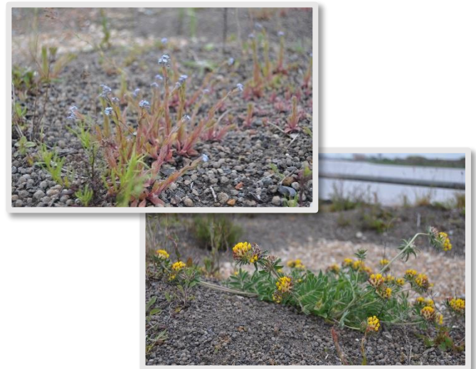
Two plant species on the green roofs.. Barking Riverside, London, UK.

The only technical issue for architects would be related to having standing water sitting directly on the waterproofing membrane for sustained periods of time. This could, however, be avoided by manipulating the design so that water was pooled in a separate layer above a drainage layer/waterproofing membrane. Thus, if the pooling layer failed, the roof would then perform as a standard free draining green roof system. Planting was based on native species of known value on brownfield sites in the region and included a range from dry to wetland species.