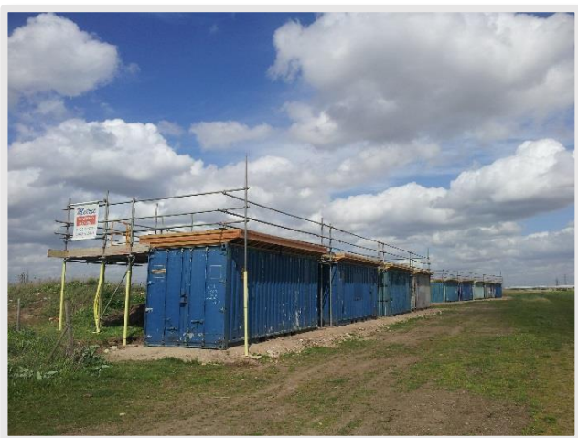
Freight containers with ephemeral wetland green roofs on top in place for experimental monitoring - Barking Riverside, London, UK.

Nine used 20 foot freight containers were purchased as the base for the experiment. The frames for the green roof test beds were constructed out of timber. Freight containers were used as a practical solution in the absence of suitable built structures. Whilst these provided only a single storey level, their position on site, close to the river corridor, meant that they were very exposed and, thus, environmental conditions on the roof would have been similar to those experienced at higher roof levels in other locations. As such, habitat development would be expected to be typical of building roof conditions. Previous studies have demonstrated that height of roof may lead to limitation for accessibility for some groups/species. However, this is a graded response in relation to height and species/groups, so further experimentation would be required to investigate any effect in relation to colonisation of ephemeral wetland roofs.