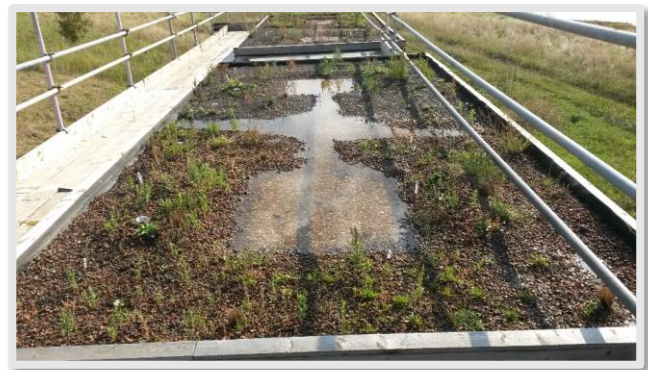
Ephemeral wetland green roof experiment after a summer rain event. Image shows the effect of manipulating the hydrological dynamics of the roofs with water pooling on the green roof in the foreground and no pooling present in the roof in the background - Barking Riverside, London, UK.

The project was mitigation for what was being lost at the time of the development. The invertebrate assemblages associated with this open mosaic habitat were a key factor in the importance of the site for biodiversity and need for mitigation.