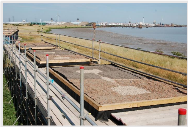
Freight containers with ephemeral wetlands green roofs with substrate installed. Barking Riverside, London, UK.

Each green roof platform was approximately 6 x 3 m and also included a waterproof membrane, geotextile filter fabric, substrate and seeds/plug plants. Edge protection was also needed because the experiment was on a live construction site and was to be regularly monitored. All materials used were standard green roof construction materials. All plant plugs and seeds were obtained by a local supplier with local provenance.